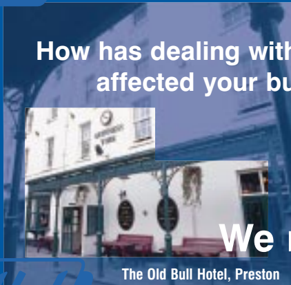
The Old Bull Hotel, Preston

The efficiency of the business has increased dramatically. We now work smarter not harder and we have experienced an 80% increase in successful performance in our day to day disciplines. Staff confidence has also risen sharply.