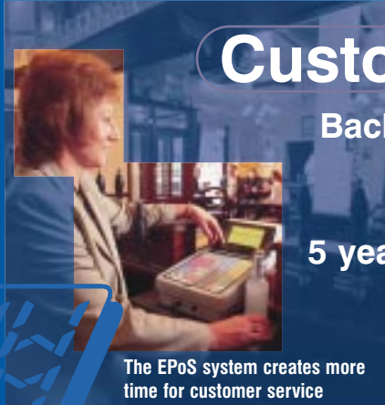
The EPoS system creates more time for customer service